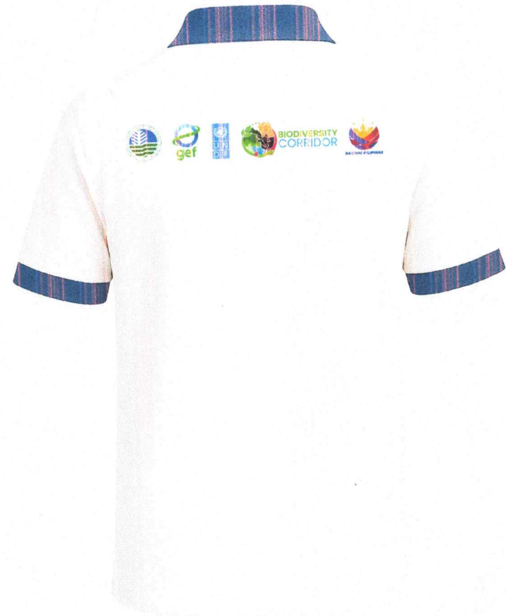
BD Corridor Polo shirt_ Study 1.2 Honeycomb Embroidered logo