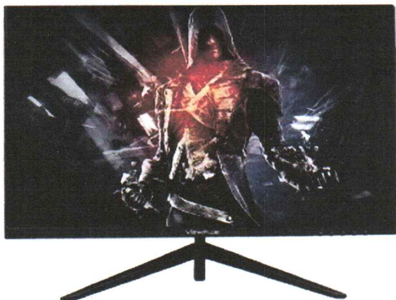
27" Flat 1920x1080@100Hz (ML-27S) VA Panel, 1 HDMI +1 VGA + 1 Audio Out