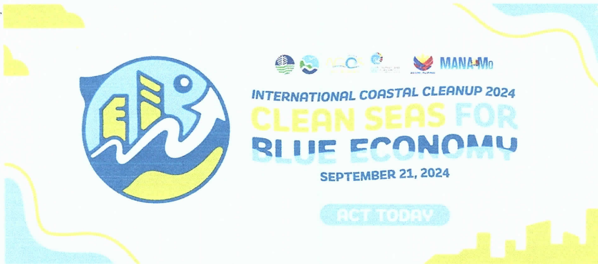
Figure 3. Banner for the Celebration of the International Coastal Cleanup 2024