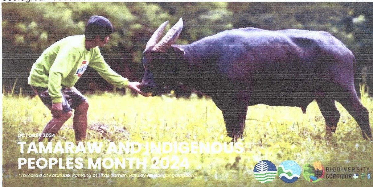
Figure 5. Banner for the Celebration Tamaraw and Indigenous Peoples Month 2024

celebrate these invaluable legacies, ensuring the continued vitality of our cultural and ecological resources.