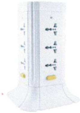
Universal Tower Extension Cord 12 Gang with Switch 1.83 meter