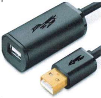
USB Extension Cable 10m Male to Female USB 3.0 Cable USB3.0 2.0 Extender Cord USB Extension