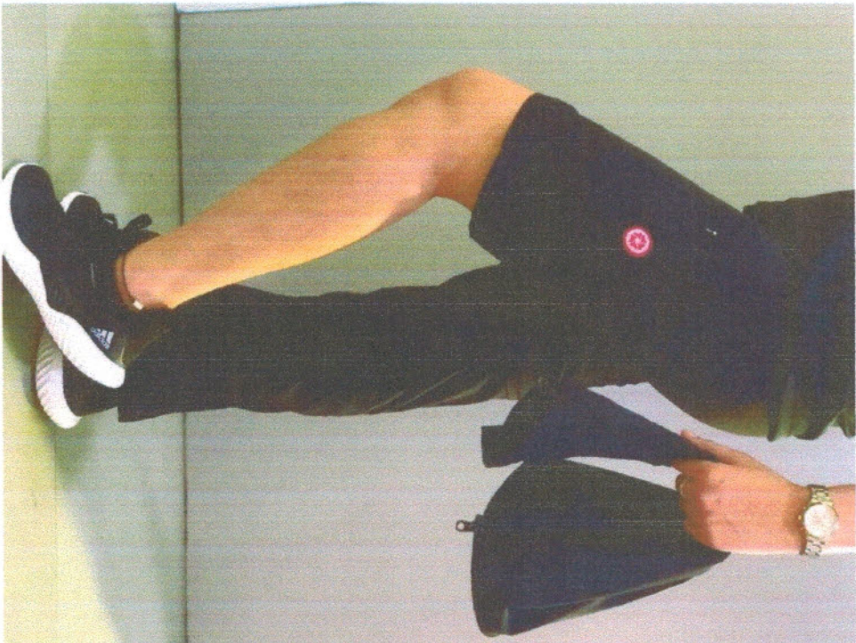
18/60: LAKAMBINI CONVERTIBLE PANTS (6 of each color shown below*)