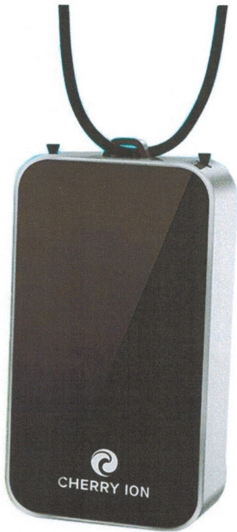
Wearable Air Purifier