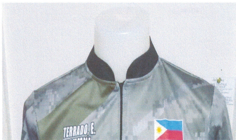
Black Collar and Zipper for reference