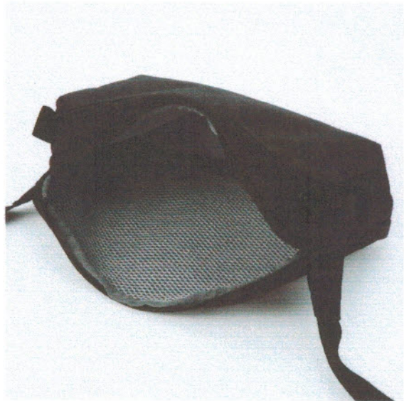
Two-layer cushioned pockets